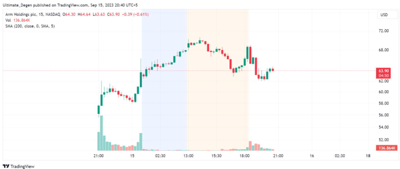
ARM stock price

The stock price forecast for ARM is relatively optimistic due to the company's high demand. Equity prices will remain relatively stable next week due to the FOMC meeting and the macroeconomic outlook. According to the accompanying graph, bulls have been purchasing all drops in the shorter time range.