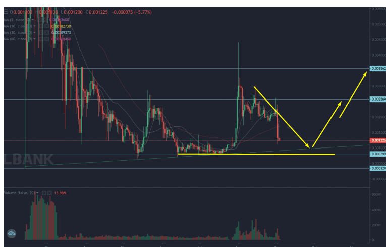
IBAT Price Chart

The 24-hour trading volume for Battle Infinity is $328K at its current price of $0.004242. The value of Battle Infinity has decreased by 7.10 percent in the previous 24 hours. As of this writing, CoinMarketCap has it at #3211 overall, with a current market cap of $. A total of 10,000,000,000 IBAT coins will ever be produced, but only zero will ever be in circulation.