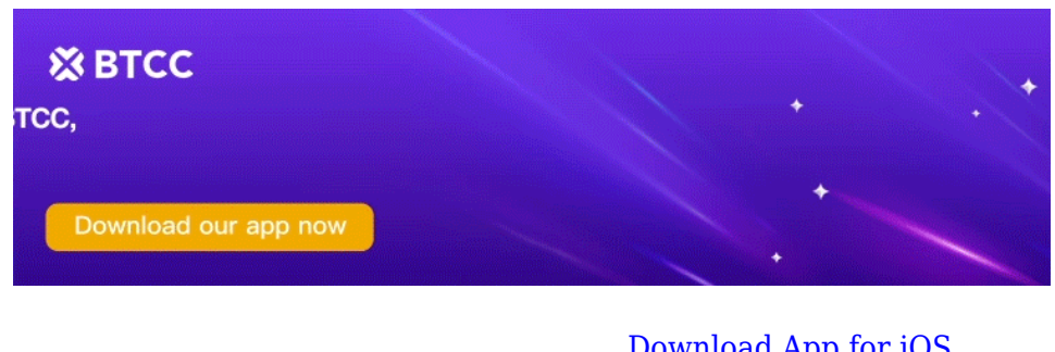
Download App for Android