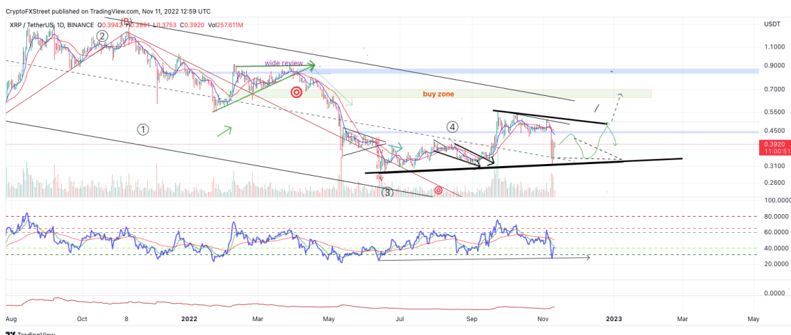
XRPUSDT price chart

Experts looked at the historical price history of XRP and forecasted a surge in the value of the altcoin. After a prolonged period of consolidation, XRP may soon make a new high above the $0.56 mark. A rally to the $0.56 level is possible if buyers drive XRP price to the $0.50 area.