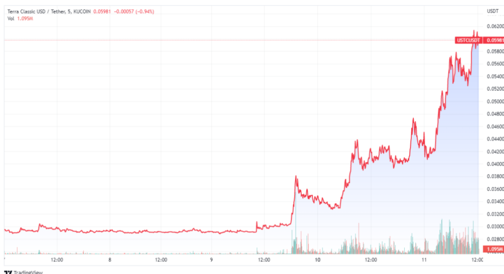
USTC/USDT Chart By TradingView

The value of one US dollar in TerraClassic (USTC) has recently skyrocketed. At the time of writing, one "stablecoin" cryptocurrency was worth $0.059. This is a rise of about 40% from its previous value.